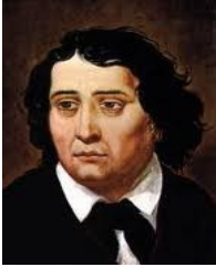
Prešeren Day of Culture: Celebrated in Slovenia on February 8th